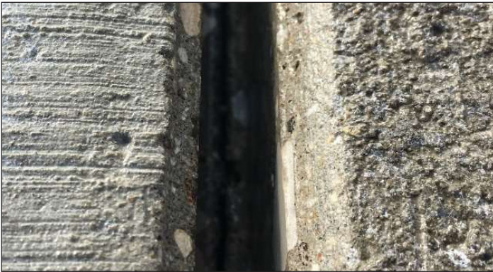
Figure 6 Joint Cleanliness After Power Washing

Air blow the joint after media blasting and also just before backer rod installation.