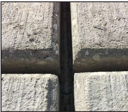
Figure 8 Airfield Joints are Typically Wider and Have Beveled Sides

As mentioned previously, airfield joint preparation often requires more comprehensive procedures. In addition, airfield joints are typically wider and have beveled sides allowing better access for power washing and media blasting (See Figure 8).