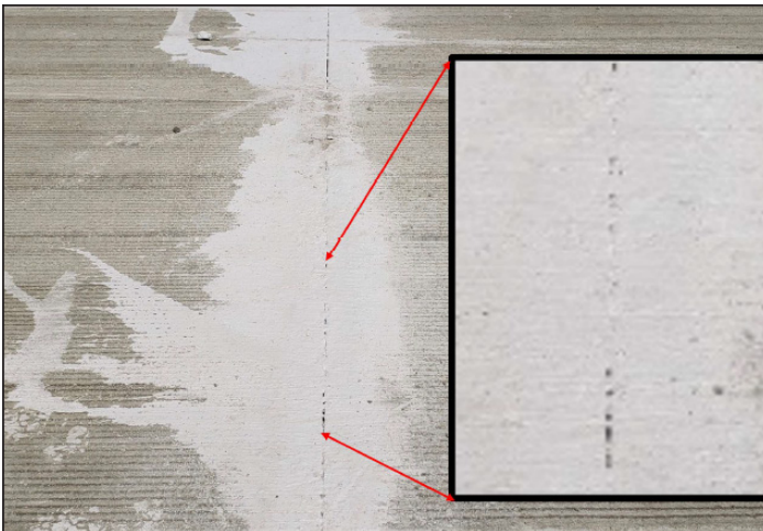
Figure 3 Photo of Dried Slurry After Narrow/Contraction Joint Sawing

Figure 3 is a photo of a narrow joint with the slurry remaining in the joint to help prevent intrusion of imcompressibles.