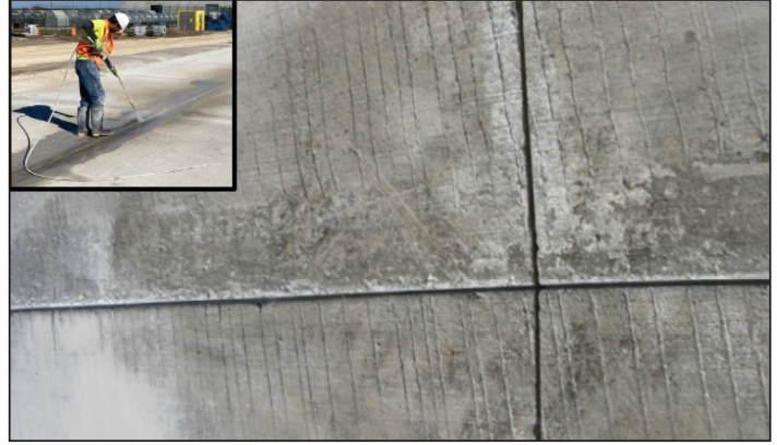
Figure 4 Example of Properly Power Washed Joints

When it is time to open the area to traffic, the remainder of the joint preparation should be conducted. For narrow/contraction joints with slurry remaining, they should be resawn the full depth of the cut with an upcut saw to remove the slurry deposit and any incompressible. A down cut saw can also be used, but an upcut is preferred due to efficiency.