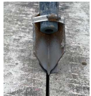
Figure 1 Media Blast Alignment Fixture

Although some specifications indicate that a separate pass for each side of the joint should be made, for narrow joints, a single pass with an alignment nozzle has been successfully used (see Figure 1). 1 The alignment tool directs the media material towards both sides. Since the joint is very narrow, it is only possible to clean the upper portion of these joints.