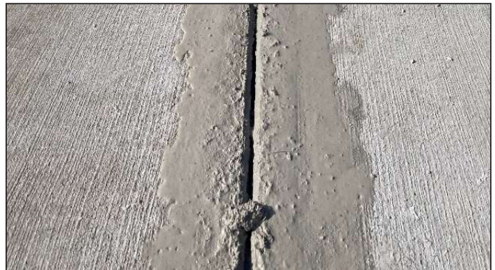
Figure 5 Indicates Slurry Produced from a Reservoir Cut

Figure 5 indicates a freshly sawn reservoir cut and how much slurry is produced.