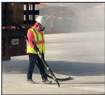
Figure 7 Additional Saw Slurry Removal Through Media Blasting

Figure 6 indicates a clean power washed joint. Note that the power wash operation extends into the contraction joint in addition to the reservoir cut.