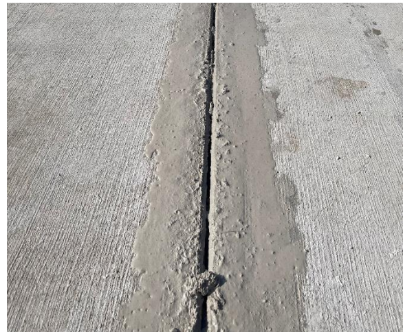
Figure 5 Indicates Slurry Produced from a Reservoir Cut

Care must also be exercised in not leaving excess slurry on the pavement surface that can become airborne from other construction operations causing OSHA compliance issues.