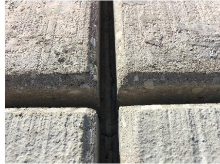
Figure 8 Airfield Joints are Typically Wider and Have Beveled Sides

allowing better access for power washing and media blasting (See Figure 8).