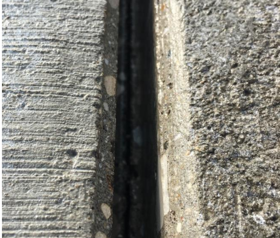
Figure 6 Joint Cleanliness After Power Washing

In Figure 7, the dust cloud from the media blasting indicates the additional slurry laitance that is being removed by the media blasting even after power washing. The media blasting also provides additional texture to the side walls providing better bonding.