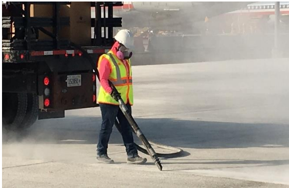
Figure 7 Additional Saw Slurry Removal Through Media Blasting

In Figure 7, the dust cloud from the media blasting indicates the additional slurry laitance that is being removed by the media blasting even after power washing. The media blasting also provides additional texture to the side walls providing better bonding.