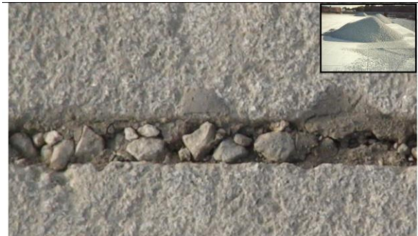
Figure 2 Incompressibles Accumulating in Joint During Construction

Figure 3 is a photo of a narrow joint with the slurry remaining in the joint to help prevent intrusion of incompressibles.