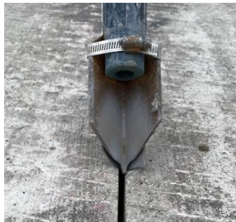
Figure 1 Media Blast Alignment Fixture

Initial sawing (contraction joint sawing) occurs soon after concrete placement and its purpose is to prevent random cracking of the pavement. Typically, walk-behind saws are used with down cutting blades. Wet sawing is still the most common process and is the focus of this Tech Brief. Early entry sawing is a different process and may require a different approach.