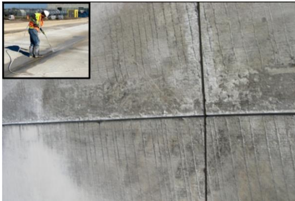
Figure 4 Example of Properly Power Washed Joints